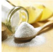
Agro - Chemical