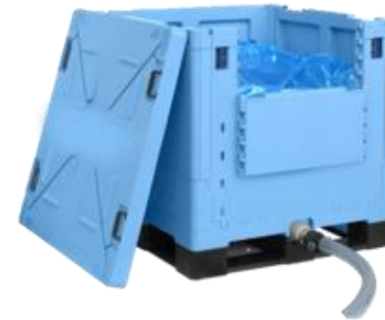
Drums with Aseptic bag